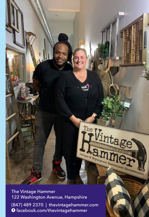
The Vintage Hammer 122 Washington Avenue, Hampshire (847) 489 2370 | thevintagehammer.com facebook.com/thevintagehammer

In addition to selling finished products, the Vintage Hammer offers classes taught by local artisans on topics like wreath-making, macrame, interior decorating and furniture painting. The Vintage Hammer also acts as a wholesale buyer, offering homemade products by local artisans such as soaps, skincare, elderberry syrup and honey.