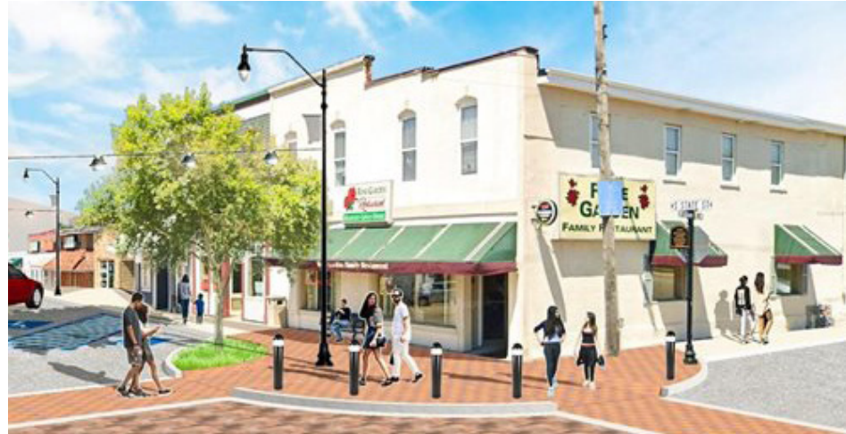
Hampshire embraces opportunity with a new downtown streetscape (rendering shown here), which will offer the community an outdoor gathering space, newly paved intersections and crosswalks, enhanced safety, beautification and improved infrastructure.

As you have read, we have several happenings in the village this summer that will improve the overall look of our community and address concerns of our residents. The downtown streetscape project will not only revitalize the look and feel of our downtown area but will make critical underground improvements. Our residents have asked us over the years to address the parking and visibility issues downtown. We hope that the parking reconfiguration, rejuvenation of both public parking lots and new restrictions on truck traffic will help families feel more comfortable