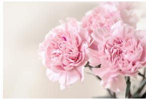
Club Official Flower: Carnation

Chartered in 1896, the Hampshire Women's Club has served the Hampshire community. One of the club's earliest achievements was the collection to assist in the care of Hampshire Center Cemetery. The club was instrumental in the founding of the Ella Johnson Library which they continue to support. They offer an annual college scholarship to a Hampshire High School female student.